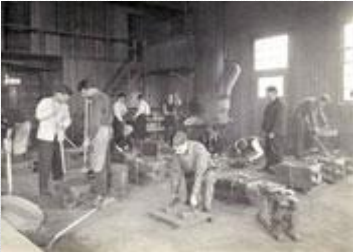
The “Old” Apprenticeships